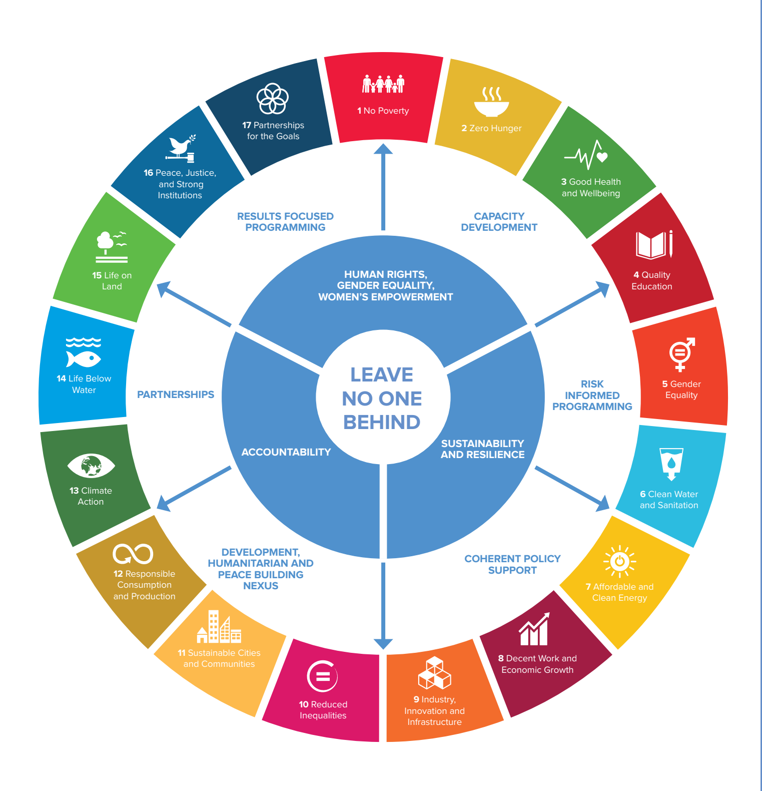
FIGURE 1 THE UN'S INTEGRATED COUNTRY-LEVEL RESPONSE TO ACHIEVE THE SDGS